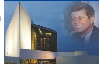
JFK Library & Museum