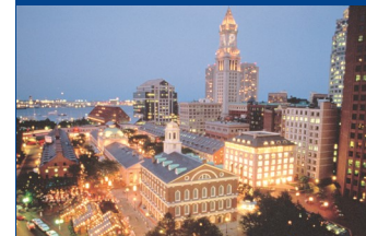
Faneuil Hall Marketplace