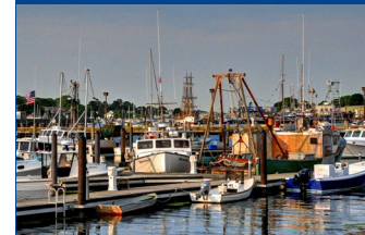
Historic Gloucester "America's Oldest Seaport"