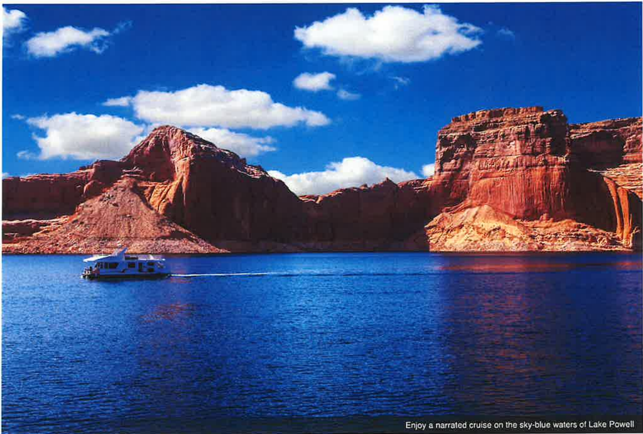
Enjoy a narrated cruise on the sky-blue waters of Lake Powell