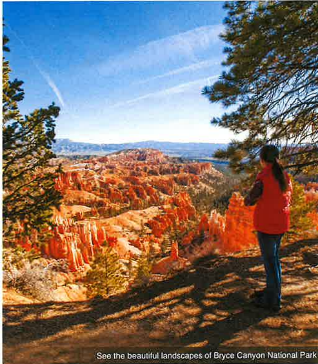
See the beautiful landscapes of Bryce Canyon National Park

Follow the Rim Drive to view the vividly-colored, fantastic rock formations approximating castles, temples and even whole cities sculptured in stone! Called hoodoos, these structures have been formed by frost weathering and stream erosion of the river and lake bed sedimentary rocks. Meals: B, D